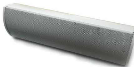
Internal/External IP Column Speaker