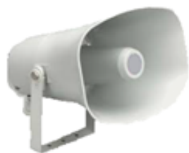
Internal/External IP Horn Speaker