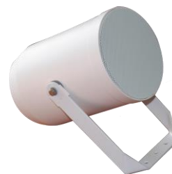
Internal/External IP Projector Speaker