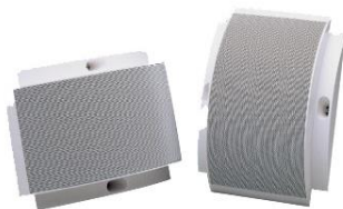
Internal Cabinet Speaker