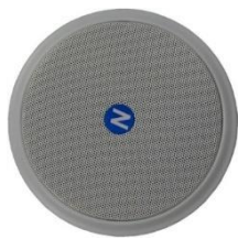
Internal Ceiling Mount Speaker