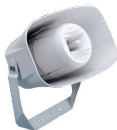
Internal/External Music Horn Speaker