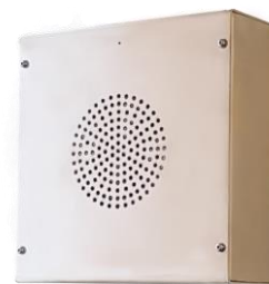
Internal Vandal Resistant Speaker