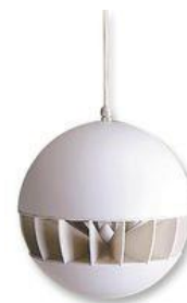
Internal Pendant Speaker